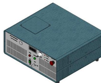
370 (L) ×406 (W) ×188 (H) mm 3