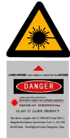
FC-W-445C (Air cooled)