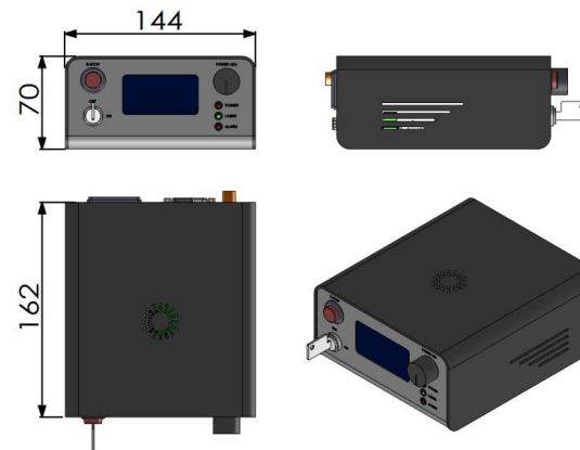
162(L) × 144(W) × 70 (H) mm 3 , 1.0kg